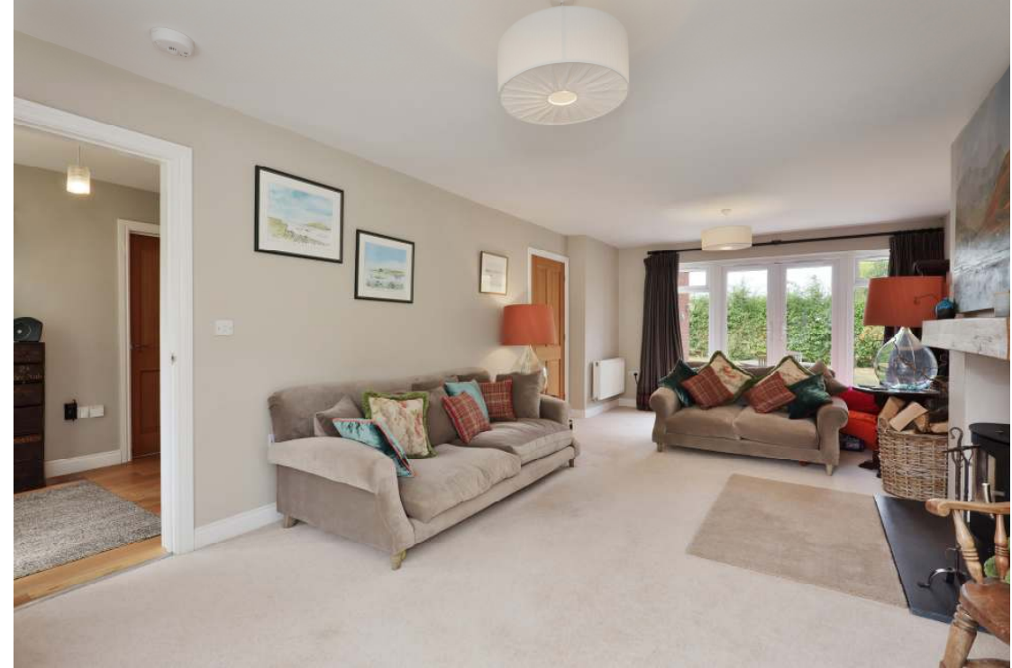
Hall leading through to sitting room and study