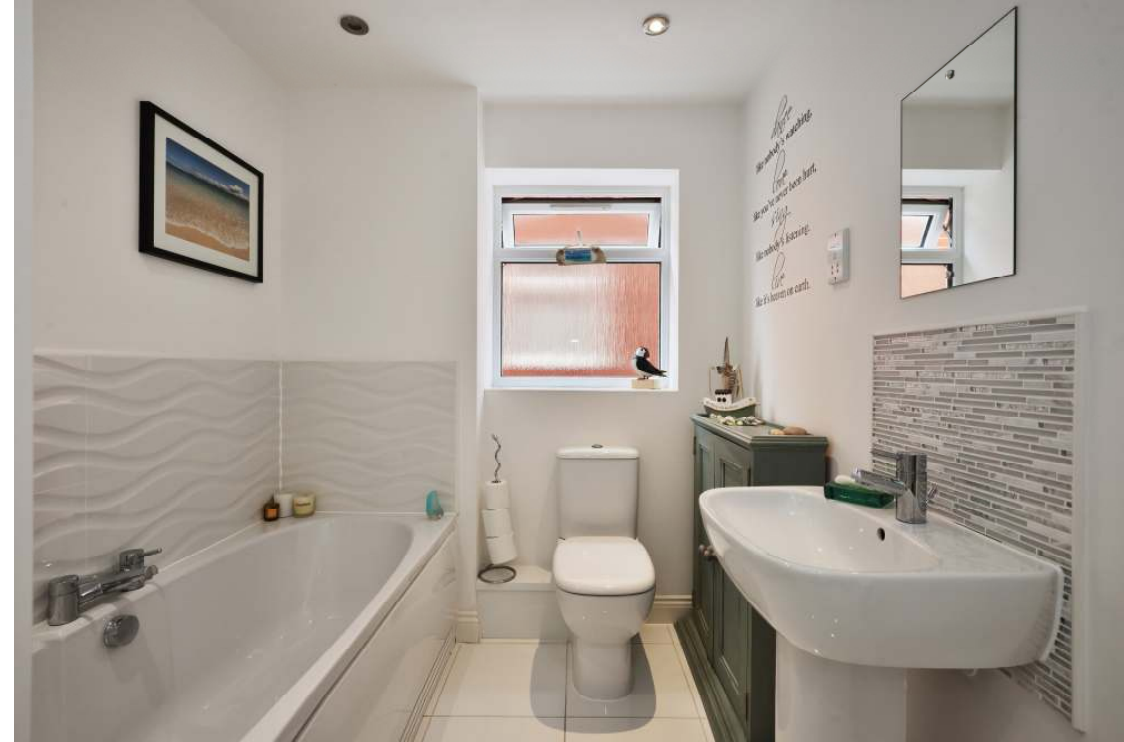
Three further bedrooms with a supporting family bathroom